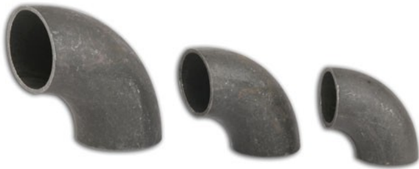
DİKİŞLİ DİRSEK DİKİŞSİZ DİRSEK SCH 40 VE SCH 80 DİRSEK